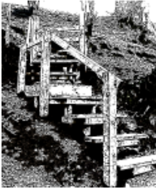
Some of Flintshire's Stilework

3. Turn left along Ffordd yr Odyn and follow it to a drive to a large house called Tyn y Coed. There is a footpath sign pointing down the drive. Walk down the drive to the garden of the house where you turn left over a stile into a field. Turn right and go down the field past the house. At an intersection of open field entrances go straight on keeping the hedge to your right past one gate until another gate is reached which gives access to the next field on the right. Go through that gate and angle across the field towards the farm house in the distance. You will cross two stiles either side of a footbridge crossing a ditch. Head towards the gate giving access to the farm yard and turn right having gone through that gate to a gate just beyond the house with metal girder posts. Go through that gate and alongside the house in the field to another stile giving access to woodland either side of the stream; once again the Terrig. Go down the intricate series of stile and steps to a footbridge and cross the stream into the next field.