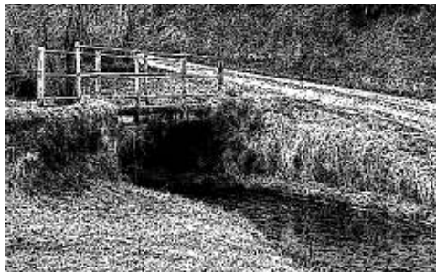
Footbridge over the Terrig

1. Walk directly up the lane opposite the school called Ffordd Rhyd y Ceirw. This levels off and eventually goes down to a lovely ford and footbridge over the stream (the Terrig). Go up the other side to where the lane joins the main road and there you will see an old public footpath sign and stile.