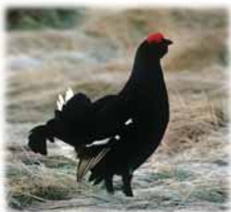
Grugiar ddu / Black grouse

Both cycling and walking tracks are completely enclosed within the forest, with no main roads to cross. The walking trails have been carefully designed, using forest tracks and natural winding paths. They are largely separate from the mountain bike trails to reduce danger and disturbance and there are clear warning signs where walking and cycling routes cross.