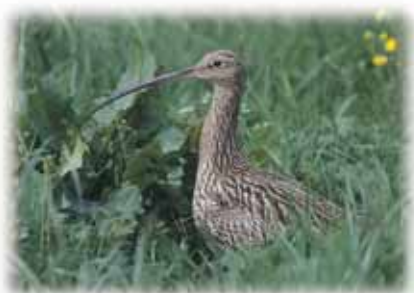
Gylfinir / Curlew