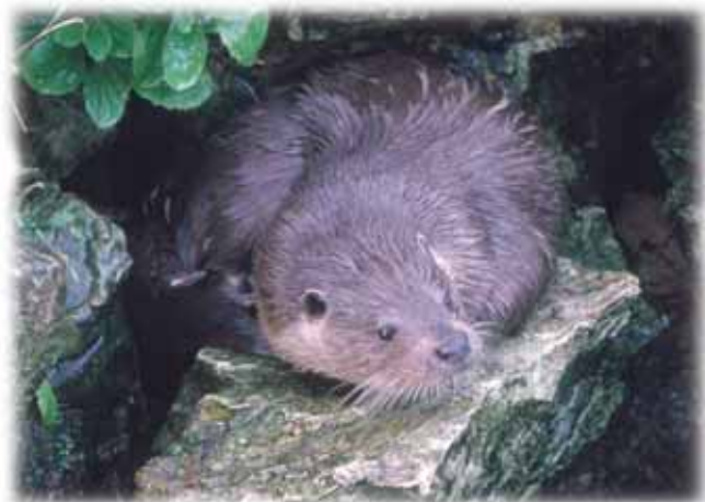
Caiff dyfrgwn gyfle i ffynnu yn nyfroedd glân yr Afon Ddyfrdwy Otters thrive in the clean waters of the River Dee

The hillfort was built in the Iron Age, sometime between 800BC and 43AD on a hill overlooking Corwen. Unlike other hillforts in this area Caer Drewyn doesn't have earthen banks and ditches but a large dry stonewall. Inside part of the hillfort you can see remains of the stone foundations of some round houses.