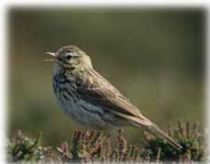
Corheddyd y waun Meadow pipit

This welcoming village inn serves real ales and is renowned for its good food. It opens from Tuesday - Sunday and on Bank Holidays and serves food at lunchtimes and evenings. Tel: 01824 790582