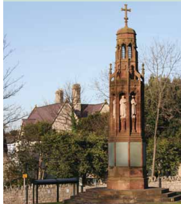
Cofeb y Cyfieithwyr The Translators' Memorial