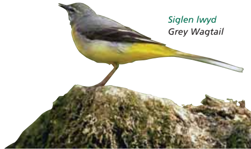
Siglen Iwyd Grey Wagtail

Cross a stile into fields and continue straight ahead, with woodland in the valley on the left and farm buildings on the right. Cross a stile at the end of the field, back onto a narrow